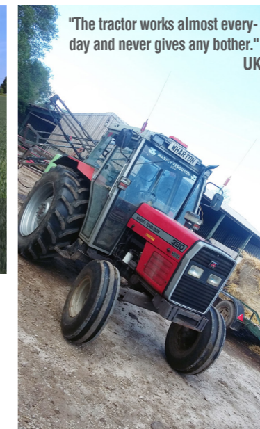
"The tractor works almost every-day and never gives any bother." UK