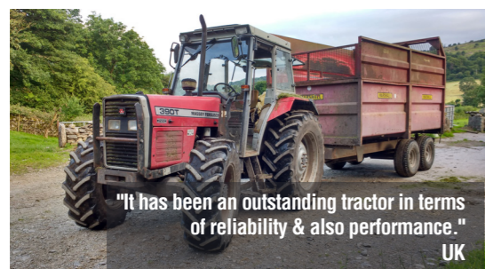
"It has been an outstanding tractor in terms of reliability & also performance." UK