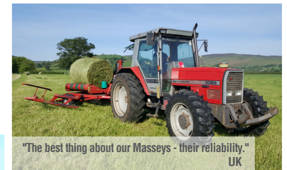
"The best thing about our Masseys - their reliability." UK