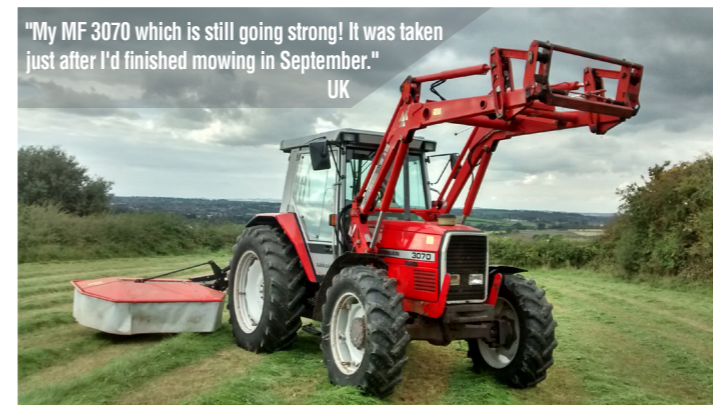
"My MF 3070 which is still going strong! It was taken just after I'd finished mowing in September." UK

See the complete range of 10+ parts by visiting WWW.MASSEYFERGUSON.COM locating your nearest MF dealer and ensuring you're buying the best for your MF machine.