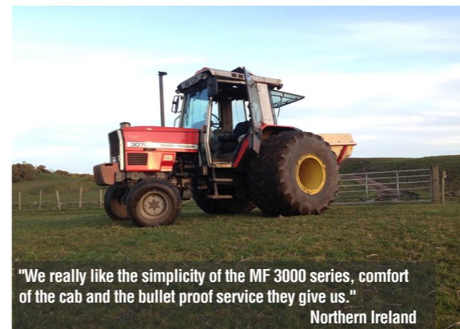
"We really like the simplicity of the MF 3000 series, comfort of the cab and the bullet proof service they give us." Northern Ireland