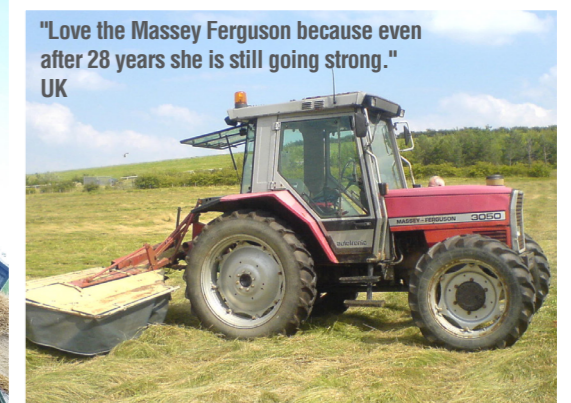
"Love the Massey Ferguson because even after 28 years she is still going strong." UK