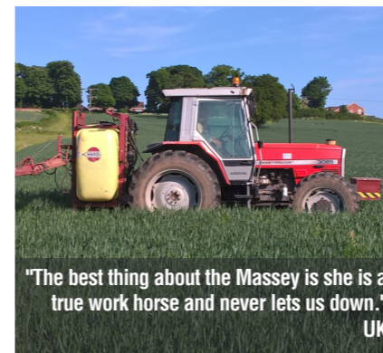
"The best thing about the Massey is she is a true work horse and never lets us down." UK