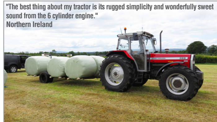
"The best thing about my tractor is its rugged simplicity and wonderfully sweet sound from the 6 cylinder engine." Northern Ireland