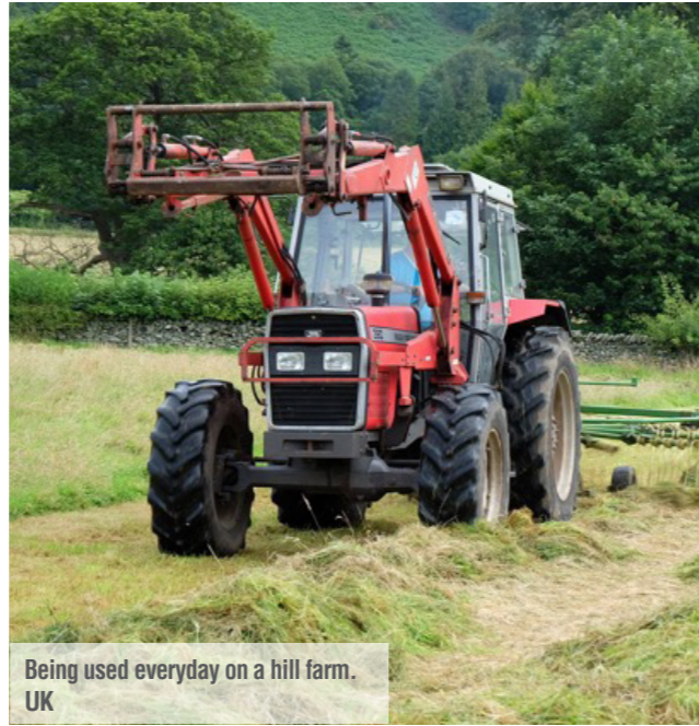
Being used everyday on a hill farm. UK