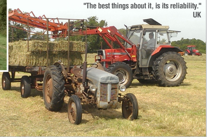
"The best things about it, is its reliability." UK