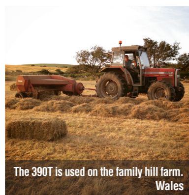
The 390T is used on the family hill farm. Wales