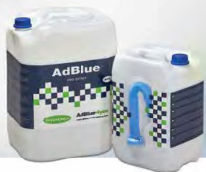
10 & 20 litre cans