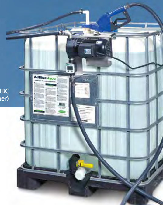
1,000 litre IBC (intermediate bulk container)

To identify the best size for your needs, calculate the litres of fuel you use annually – your AdBlue® usage will be 4% - 6% of this figure – remember you should use your AdBlue® within 12 months of opening to avoid wastage.