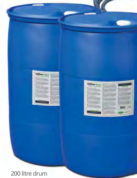
200 litre drum

Should you have any further questions, or require more information, please do not hesitate to contact your local AGCO dealer who will be happy to help.