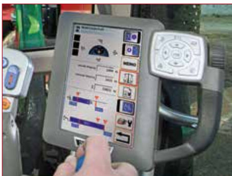
The settings for the CargoProfi are adjusted easily and intuitively with the Varioterminal.