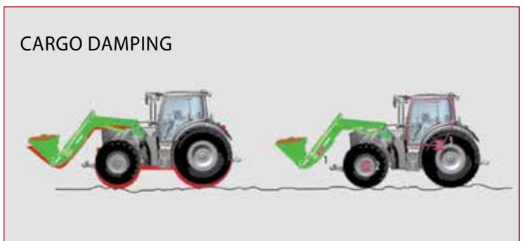
Front loader with damping system:

Gas pressure reservoirs act as shock absorbers and prevent vibrations from being transmitted to the tractor body. The integral damping system (1), together with front axle suspension (2) and cab suspension (3), ensures superior ride comfort (optional).